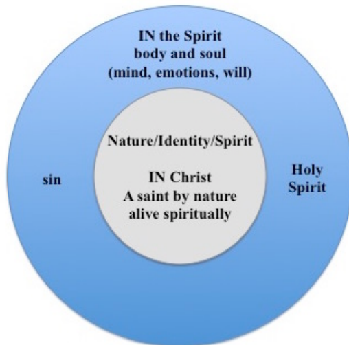
In Christ and In the Spirit