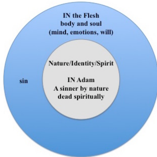
In Adam and In the Flesh